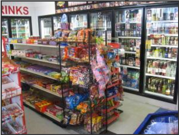
1711 Lockbourne Inside IMG_2235